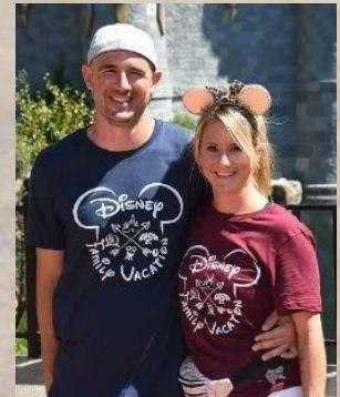
A little about Leo