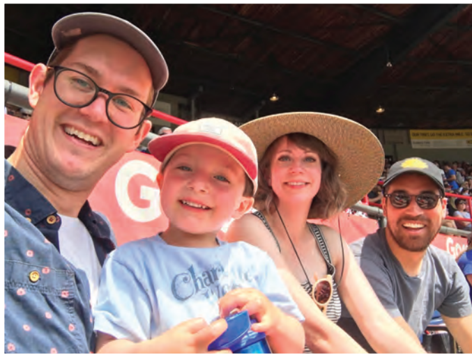
BASEBALL GAME WITH OUR BEST FRIENDS