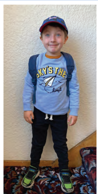
FIRST DAY OF PRESCHOOL

We are excited and looking forward to expanding our family even more.