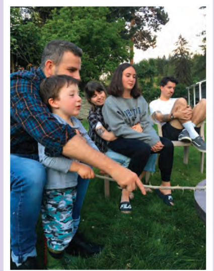
ROASTING MARSHMELLOWS WITH COUSINS