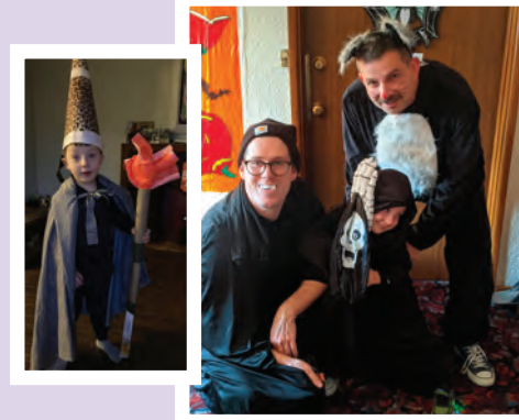
HALLOWEEN GHOULS + HENRY THE WIZARD

After such a challenging year, we are looking ahead with optimism and hope.