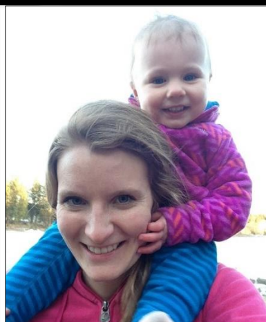
Auntie Ari babysitting